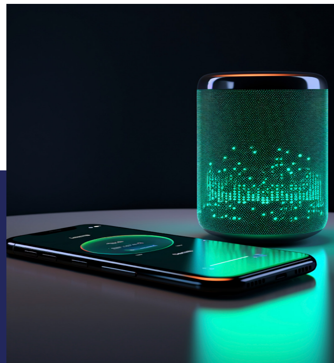
Connected objects / IoT