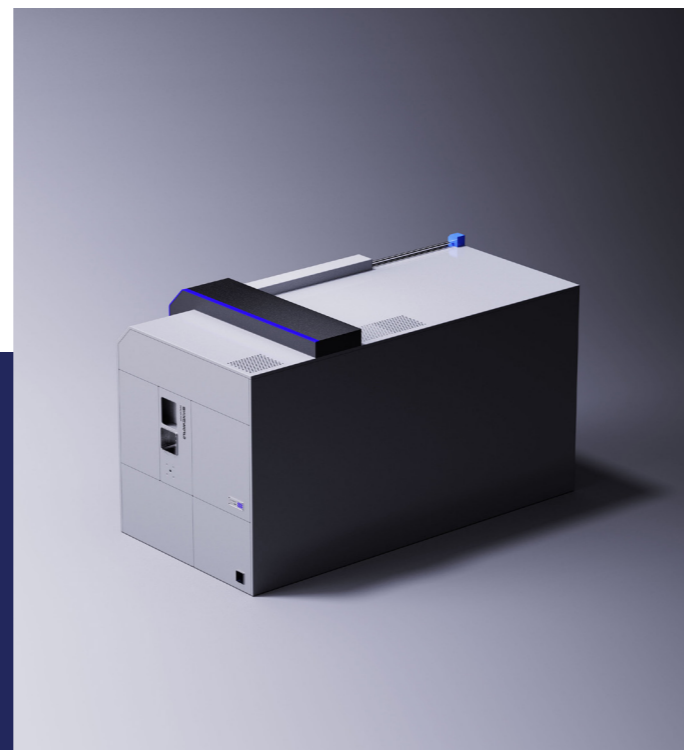
Industrial products and equipment