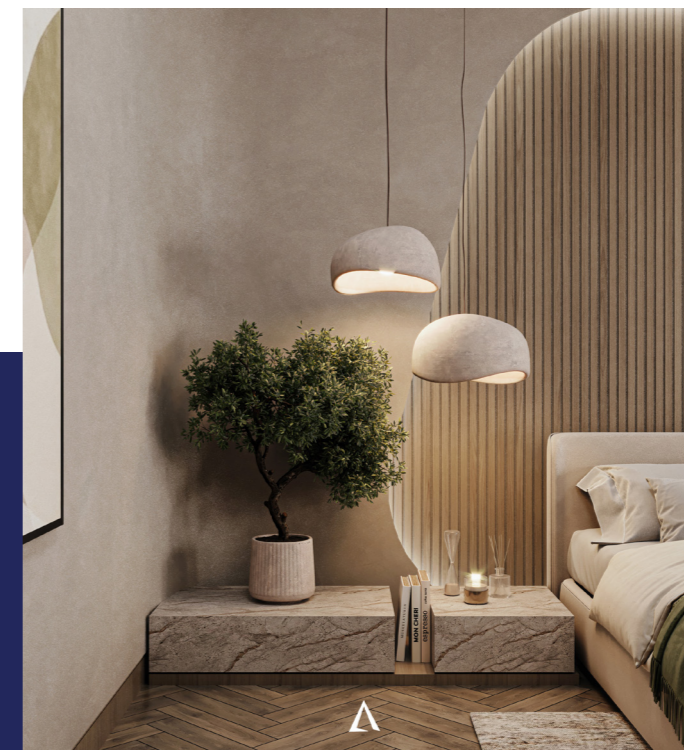
Furniture, lighting, and decorative items