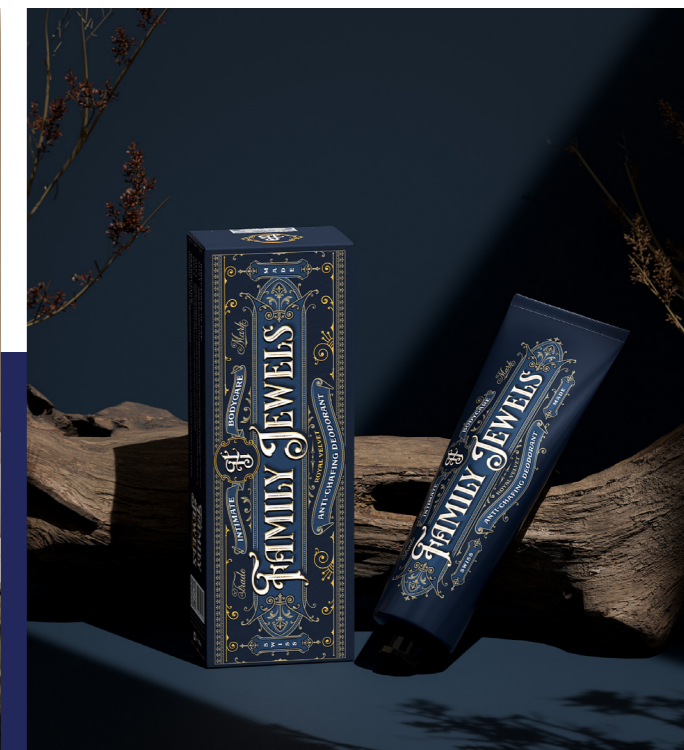
Packaging and promotional products